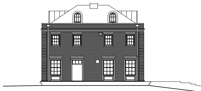
2 EXISTING WEST ELEVATION AB7 SCALE: 1/8" = 1'-0"