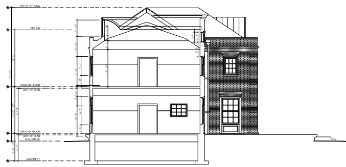
2 EXISTING SECTION LOOKING EAST SCALE: 1/8" = 1'-0"